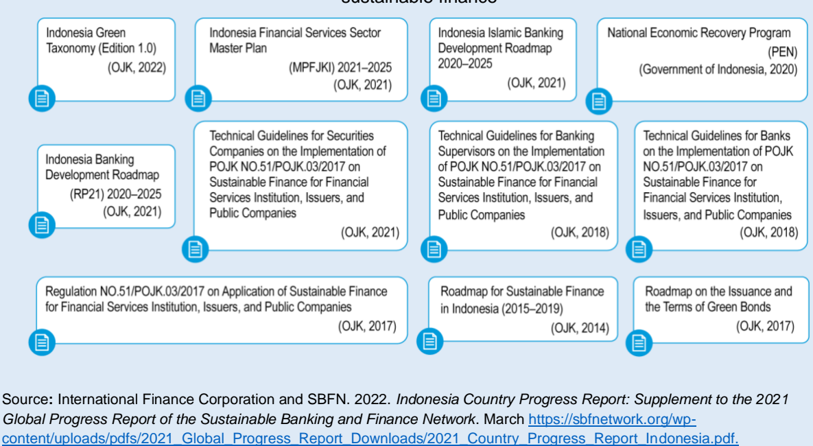
Figure: Indonesia's non-pricing financial policy efforts to create an enabling environment for sustainable finance

The national strategies, roadmaps, policies, voluntary principles, regulations, guidelines, research, templates, and tools that provide an enabling framework for sustainable finance in Indonesia are shown in the following figure.